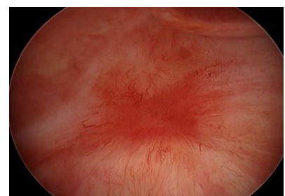
Fig 3: Bladder with IC (ulcer)