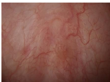
Fig 1: Normal Bladder

You will have some or all of the above symptoms. Your gynaecologist will do tests to rule out other diseases which may cause similar symptoms. These may include tests for bladder or vaginal infections, bladder cancers or endometriosis. Your gynaecologist may also perform a test called a cystoscopy, which involves placing a small camera into your bladder to evaluate the appearance of the bladder wall. At the time of cystoscopy, the bladder is filled with saline and inspected for particular features such as bleeding spots (petechiae) or splitting of the bladder wall lining (fissures). If women suffer from the above symptoms, but we cannot identify these changes within the bladder, the condition is called painful bladder syndrome (PBS). If these features are present at cystoscopy, a diagnosis of interstitial cystitis (IC) is made (a subset of PBS)